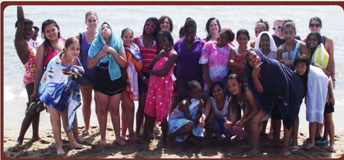
Smiling faces at Hammonasset.