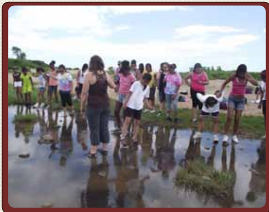
Exploring a tide pool at Hammonasset State Park.