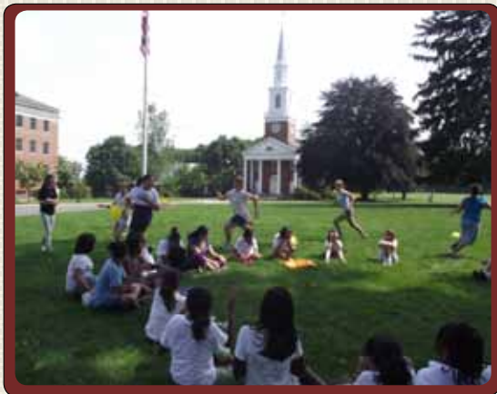
Recess break on the campus of Ethel Walker School.

Grace Academy students extended their academic year with classes at Ethel Walker School and field trips to Mystic Seaport and Hammonasset State Park.